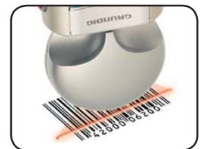
... and scan